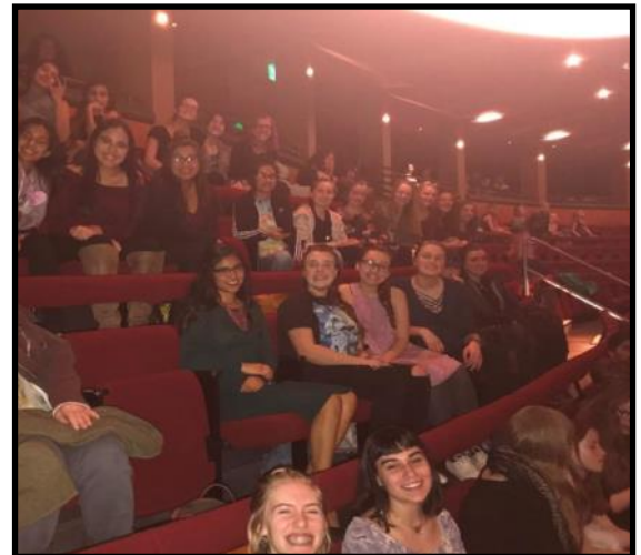
Students visited Colorado Ballet to see Romeo and Juliet on Thursday, Feb. 15